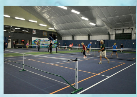
23 Leighton Road, Augusta

Attendees are encouraged to bring a pair of sneakers to try out the game of Pickleball! First time attendees to the A-COPI Tennis & Sports Center will be given a complimentary 30 minutes of free court time.