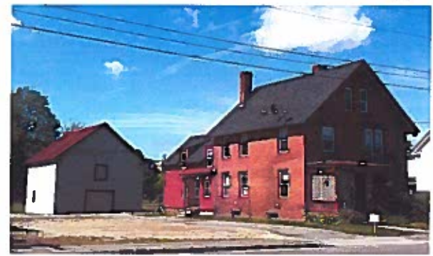
3 Family home currently under renovations. Apartments available fall 2018

FOR MORE INFORMATION PLEASE CALL (207) 873-510