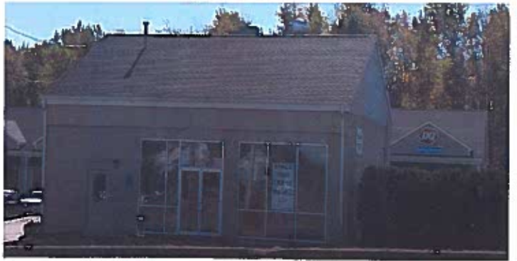
One of Waterville's busiest streets. Great mix of tenants in KMD Plaza to attract customers to your business