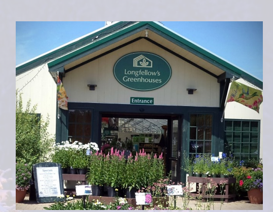
81 Puddledock Rd., Manchester

Every Business After Hours is an incredible opportunity to win amazing door prizes and take part in the 50/50 raffle. Delicious hors d'oeuvres will be available and guests are welcome to partake in the cash bar.