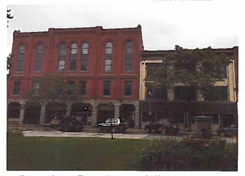
Premium Retail and Office Space Elevator Access Only 1 unit left