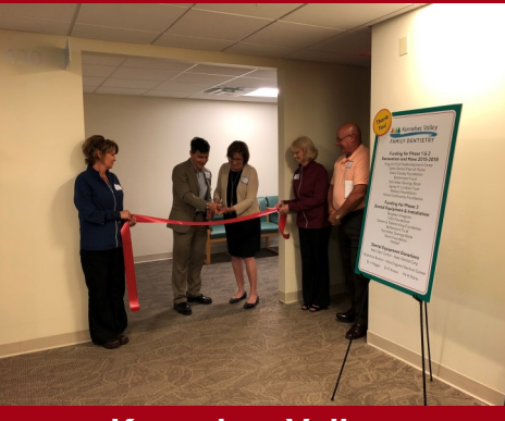
Kennebec Valley Family Dentistry